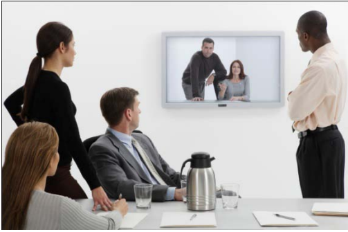
San Jose and Omaha Toastmasters' First Joint Meeting via Video Conference

On April 21, 2010 Two PayPal Toastmasters clubs held their very first joint meeting via video conference proving the effectiveness of the technology. Video conferencing is not new to PayPal but its nuances can sometimes be tricky. Add in the machinery of a Toastmaster's weekly meeting and you have a recipe for a