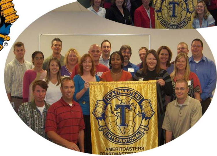
Top - ConAgra - Jam and Toasters; Middle - ConAgra Chatter Platters; Bottom - Ameritoasters

Congratulations to Jam and Toasters, Chatter Platters and Ameritoasters on their Charter Parties.