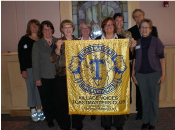
Members and mentors of Village Voices Toastmasters Club celebrate their charter at the Hillmer Art Gallery at the College of St. Mary in Omaha, NE!