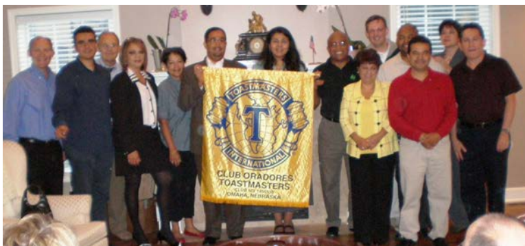
Members of Club Oradores, District 24's first bilingual club, celebrate their charter in Omaha with both a party and a fiesta!

Note: The date of the Double Dozen will be changed to the following month. For example, you will actually receive the November edition before the end of October—just like a magazine on the newsstand.