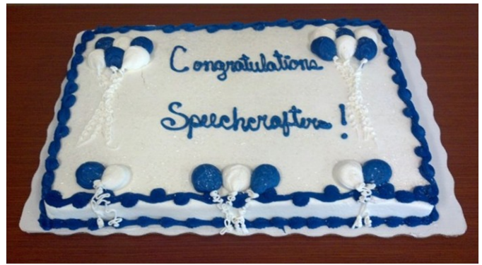
There is nothing like a cake to celebrate success.

it can be a needed shot in the arm to reengage a club to follow the path and processes of Toastmasters.