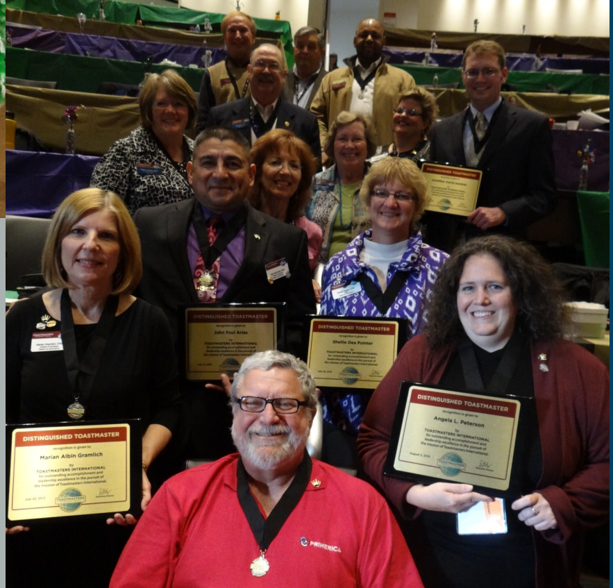
Right: Toastmasters who received their DTM at the fall conference pictured with Dignitaries.