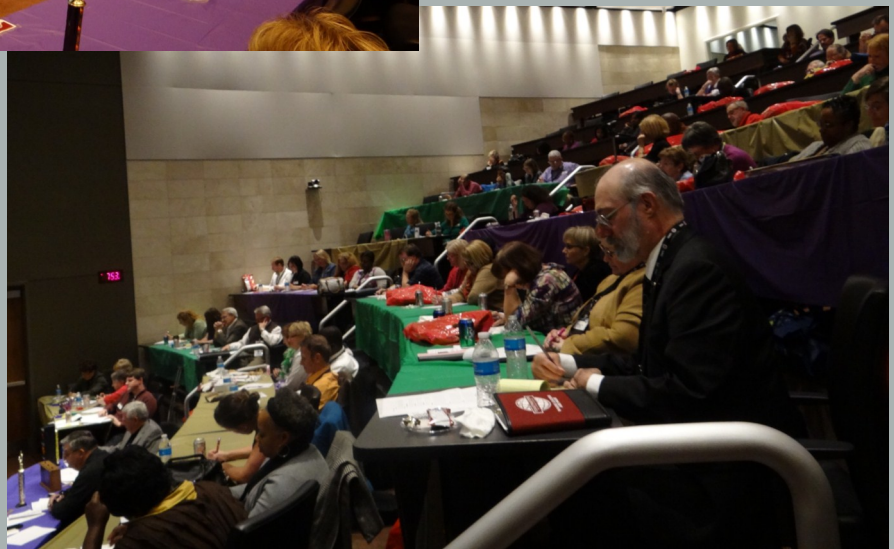
Right: UNO Mammel Hall Auditorium Decorated with Mardi Gras Flair.