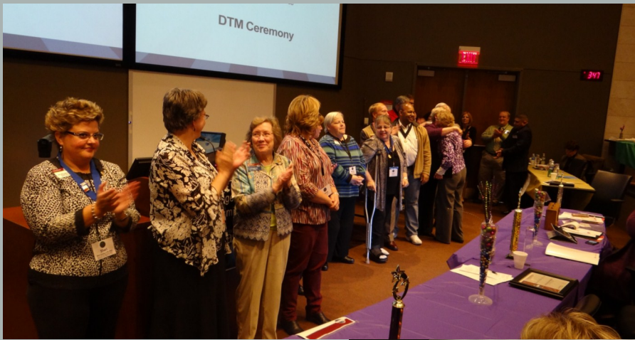
Above: Current DTM's stand in Line top congratulate new DTMs.